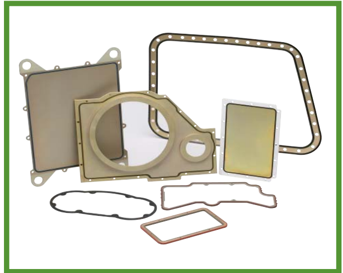
Gask-O-Seal and Integral Seals are used in a wide range of military, communications, aircraft and marine applications.

The Integral Seal design eliminates the need for a machined or molded groove in the mating hardware. The seal is kept in place by chemically and/or mechanically bonding the elastomer to the retainer edge. Seals can be molded to metal retainers as thin as .025 in (.635 mm).