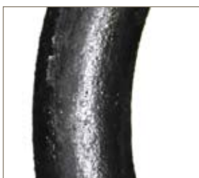
Competitor A after