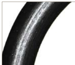
High temp. FFKM before