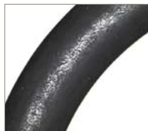
Competitor A before