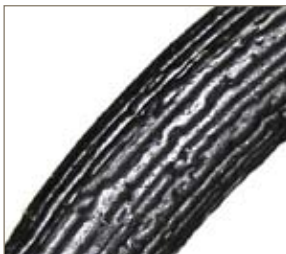
High temp. FFKM after