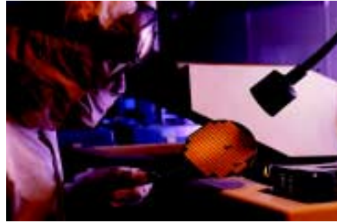
Parker sealing products are engineered to perform in critical semicon fabrication environments.

Parker Hannifin's Composite Sealing Systems (CSS) Division is an industry leader in the design and manufacture of high reliability sealing devices for the semiconductor processing industry. Using a combination of various metal or plastic retainers with molded-in-place (or vulcanized) elastomeric seals, CSS provides fabs with innovative, custom-engineered products that boost productivity and dramatically reduce contamination.