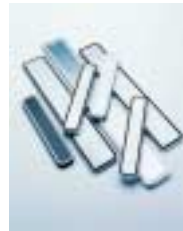
UHP Slit Valve Doors for process chamber sealing