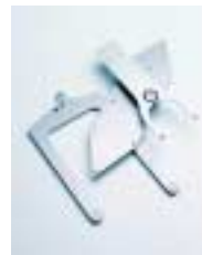
End Effectors for wafer transport.