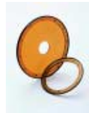
Thermoplastic Thrust Plate Integral Seal for copper deposition processes.